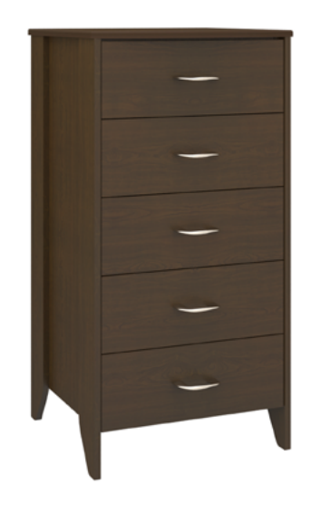
Model: EXCH50 24.25W 19.25D 46.75H

The contemporary Essex collection features a distinctive leg design providing a dimensional look that allows for easy cleaning. Select tone-on-tone or contrasting woodgrained finishes for legs and top. Customizable and available in a variety of sizes. Sophisticated hardware delivers added style.